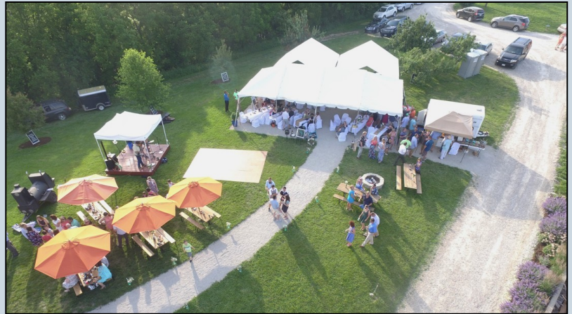
Plenty of level ground for additional event tents and stage.