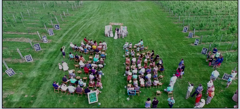
Perfect-sized venue for weddings up to 150 guests.

An ideal design to host weddings and other private events with room for additional tent seating, a band stage/dance floor for live entertainment and a picturesque vineyard and pond as the perfect backdrop.