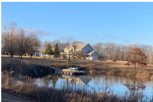
Enjoy a lake view from your home