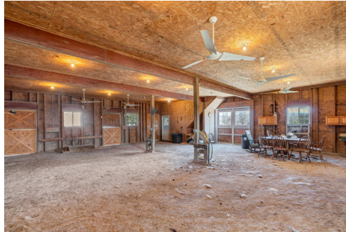
Electric, plus hot/cold running water