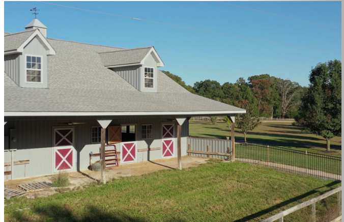
Plenty of surrounding fencing