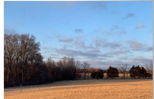
Gorgeous surrounding woods