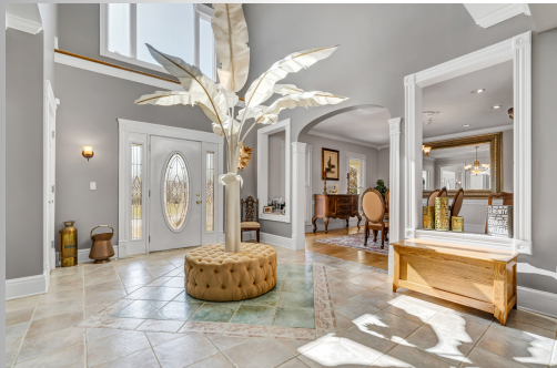
Stunning entry foyer

A stunning 2.5 story estate home with so many elegant features to enjoy! From custom millwork to elegant lighting to top notch flooring and huge windows throughout allowing natural light, this home truly has it all.