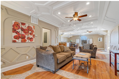
Cozy living room area