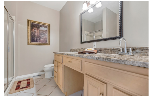
Two full, elegant baths