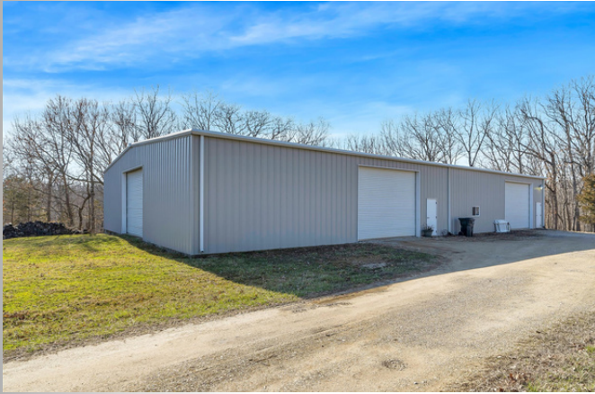
All steel outbuilding with overhead garage doors