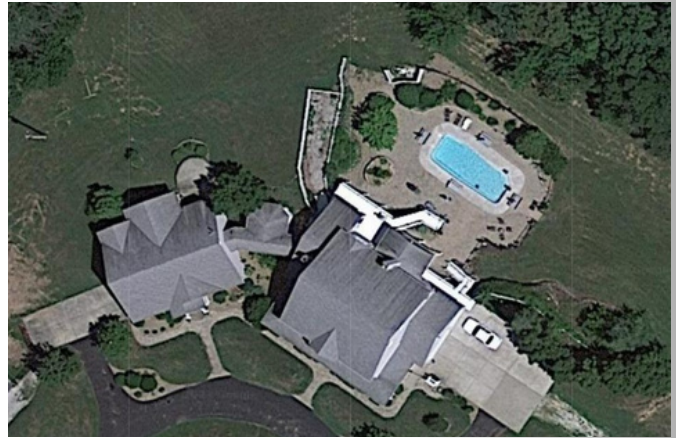
Aerial view of homes and pool