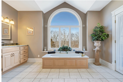
Primary bath suite with spa tub