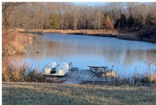
Nice private boat dock