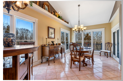
Breakfast nook with ample daylight