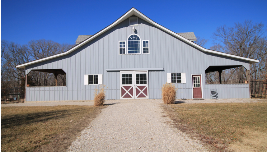
10-stall horse barn, 8 on main level & 2 in basement