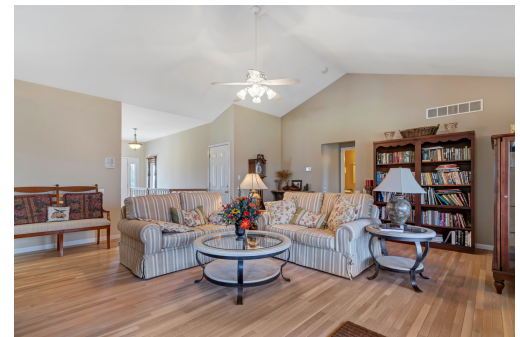
Vaulted ceiling in living room