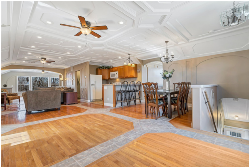
Gorgeous caretaker's apartment upstairs

A horse enthusiast dream!!! A huge 10-stall barn with luxury 1,200 sq ft caretaker's apartment on the 2nd floor. Some of the most stunning millwork & top-of-the-line features complete this luxury living space.