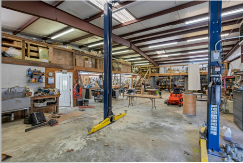
Concrete flooring & 400 amp electric