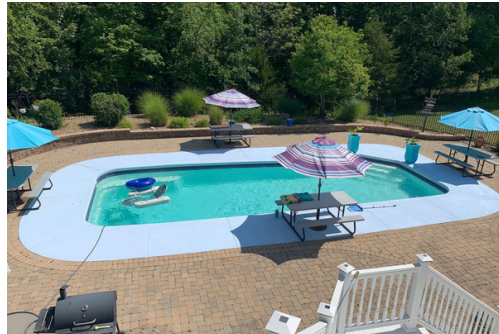
Gorgeous fiberglass inground pool