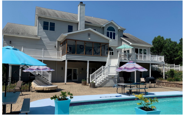
Back deck & screened porch leading to inground pool & patio