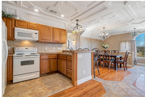
Custom cabinets in kitchen