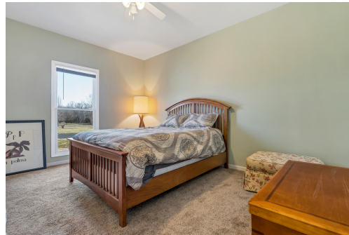
Bedroom two, walk-in closet