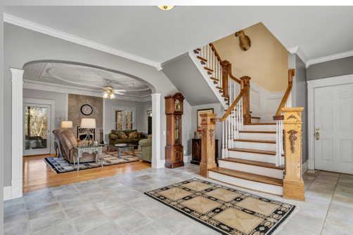
Custom woodwork on staircasing