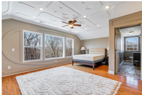
Studio sleeping area with great views