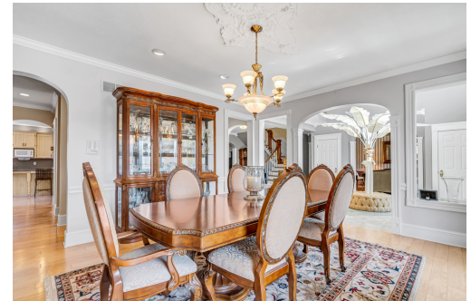
Elegant formal dining room