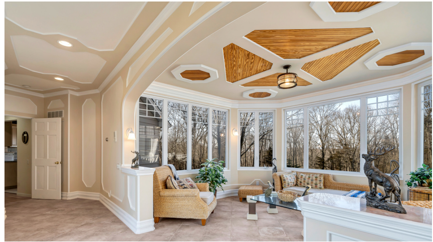
Gorgeous sitting room adjoining main home to caretaker's home