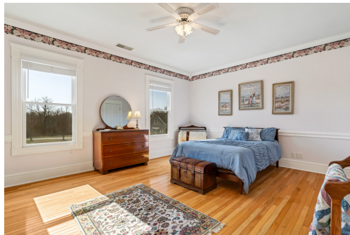
Bedroom two with custom millwork