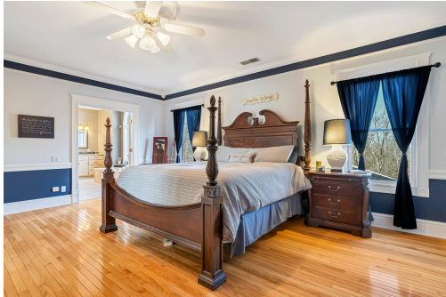
Primary bedroom suite