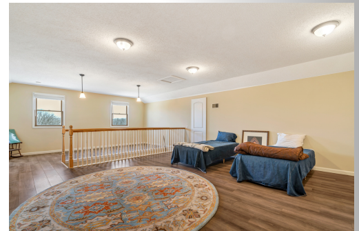
Third floor additional loft/sleeping area