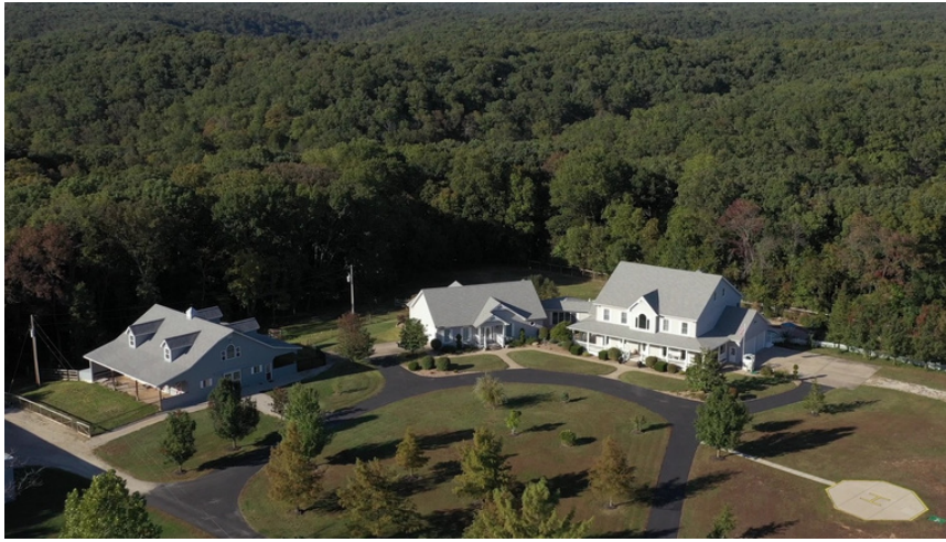
Overhead view of main home & attached caretaker's home