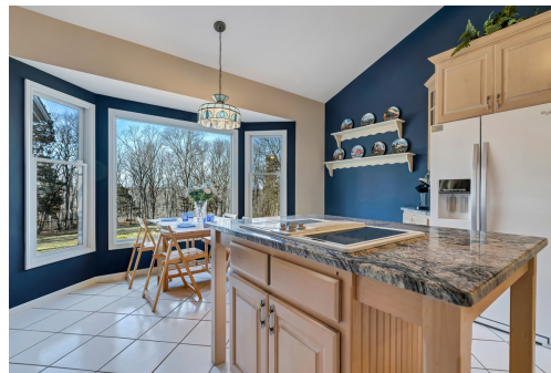
Beautiful view in eat-in kitchen