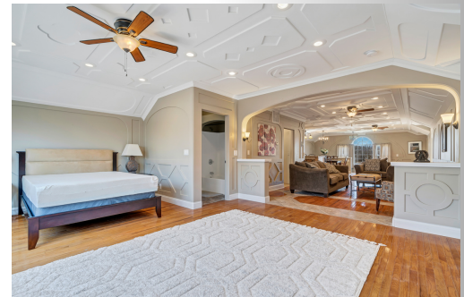
Custom millwork throughout