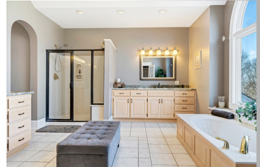
Two separate vanities & shower stall