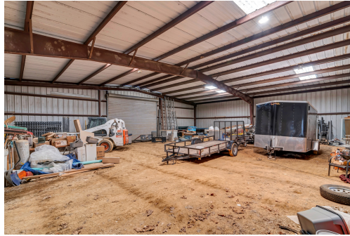
Tons of storage space for equipment