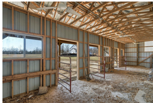
Three horse stalls