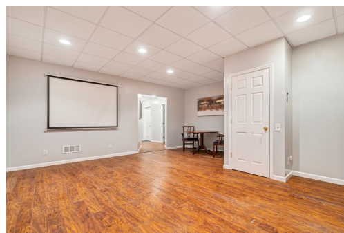
Finished recreational area in basement