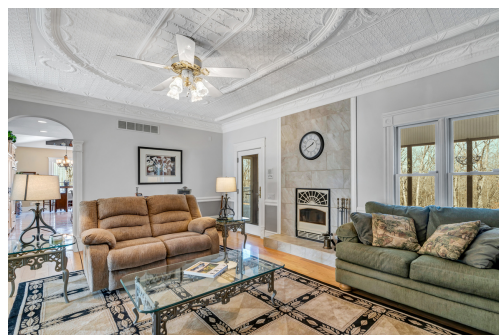
Cozy hearth room with fireplace