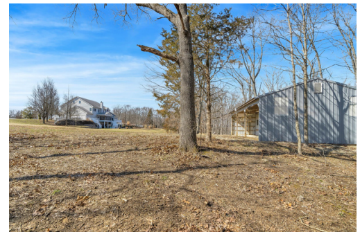
Across property from house/barn

Set off the back corner of the house sits another 24 x 42 outbuilding that contains three additional horse stalls, has running water and is fenced and cross fenced. All on 22 acres for your horses to enjoy!!!