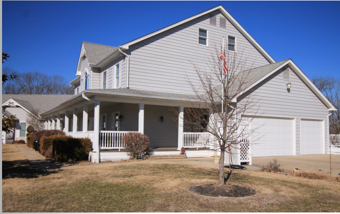
Side-entry 3 car garage, covered front porch