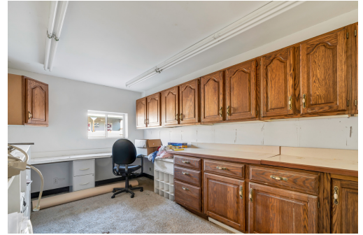
Heated office area

The perfect space for storing all of your recreational equipment and an ideal hobby/workshop area! This is the true ultimate workshop set-up complete with a 40 x 60 heated & insulated machine shop, concrete flooring, overhead garage doors, 400 amp electric service, plenty of overhead lighting, hot/cold running water and a heated office area.