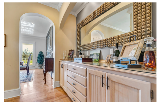
Butler's pantry off kitchen