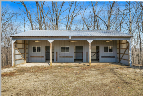
24 x 42 outbuilding