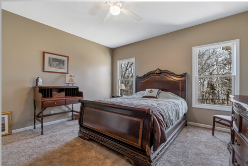
Bedroom one, walk-in closet