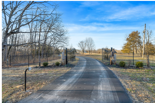
Intercom system at entrance