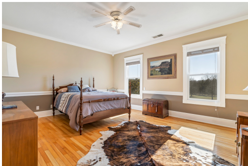
Bedroom one with custom millwork