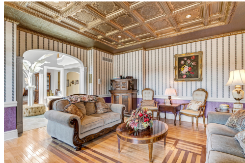
Relaxing formal sitting room