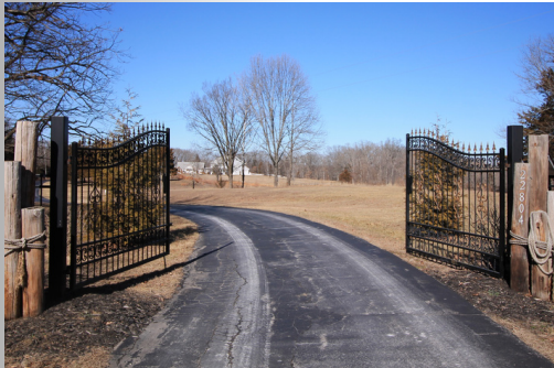
Gated entry & asphalt drive