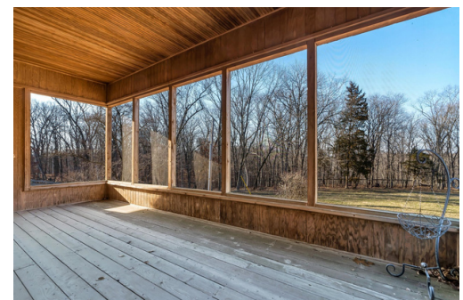
Spacious screened-in back porch