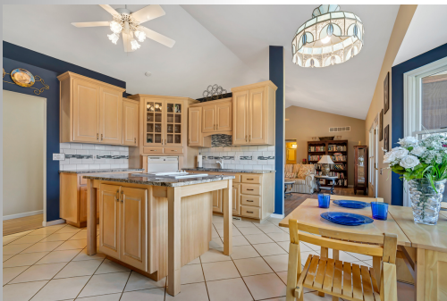
Gourmet kitchen with custom cabinetry

This second home on the property is the perfect set-up for extended family. Attached for convenience of care, yet a true separate living area to enjoy your own personal home with the same level of elegant features!