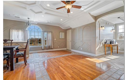
Hardwood & tile flooring