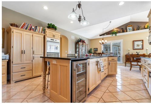
Center island with built-in wine cooler