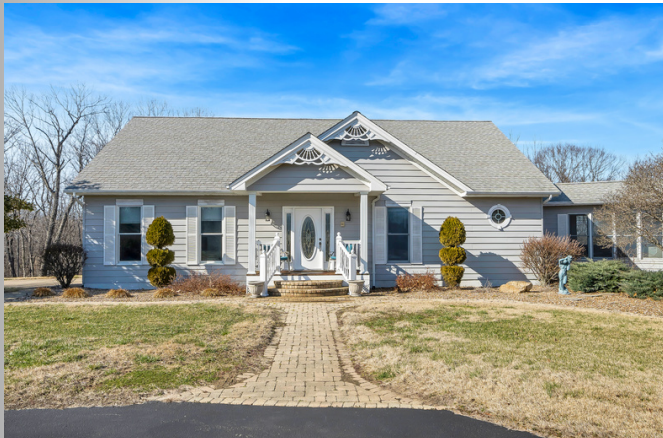
Screened back porch, side-entry 1 car garage,