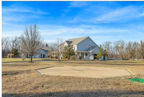
Elusive helicopter pad