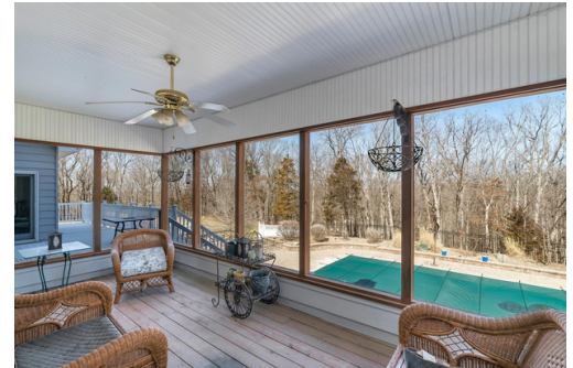
Screened in porch overlooking pool