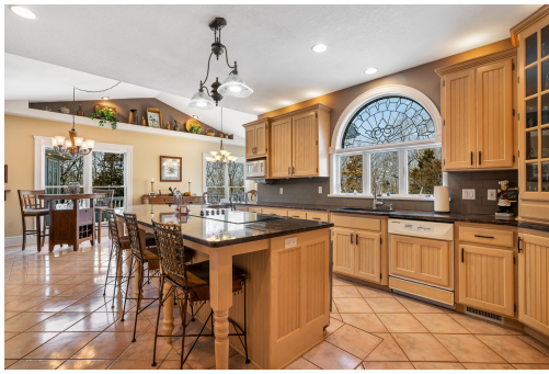
Gourmet kitchen with custom cabinets