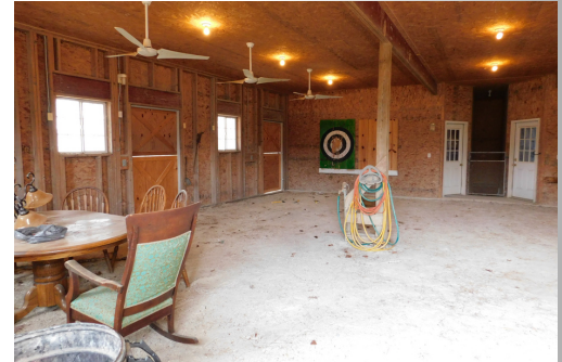
Additional office area & tack room