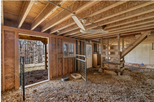
Walkout basement stalls