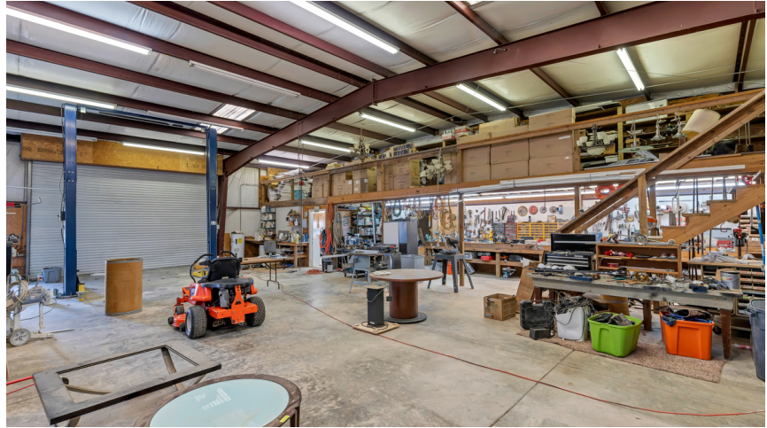
60 x 40 heated & insulated machine shop w/ hot/cold water